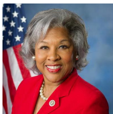
U.S. Rep Joyce Beatty (D-Ohio-3)